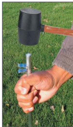
Figure 3. Hard Ground Installation