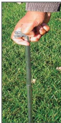
Figure 2. Soft Ground Installation