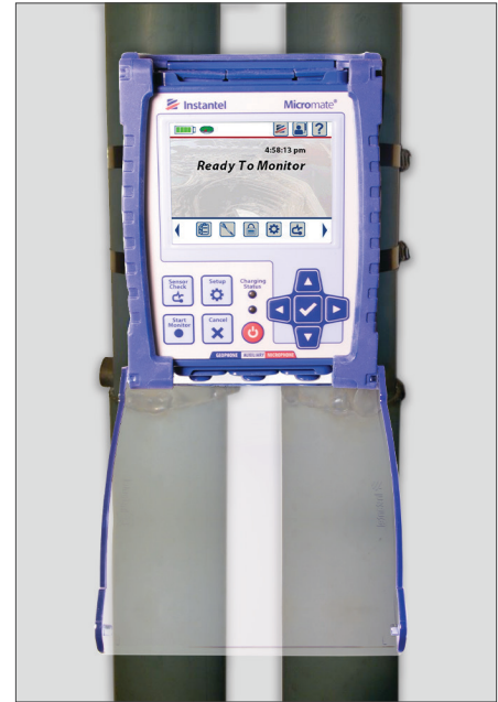
Accessing the installed Micromate Unit