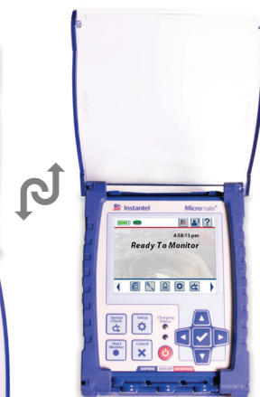
Hand-held cover opens up