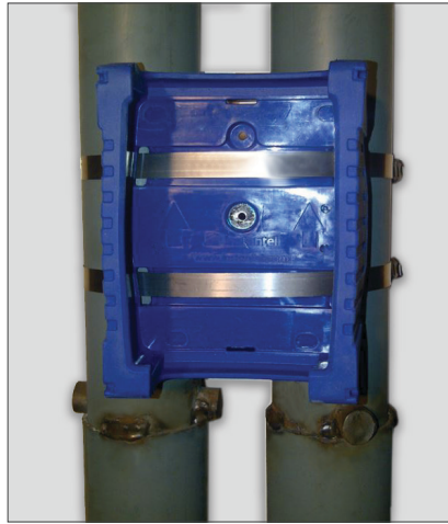
Protective Boot attached with metal straps