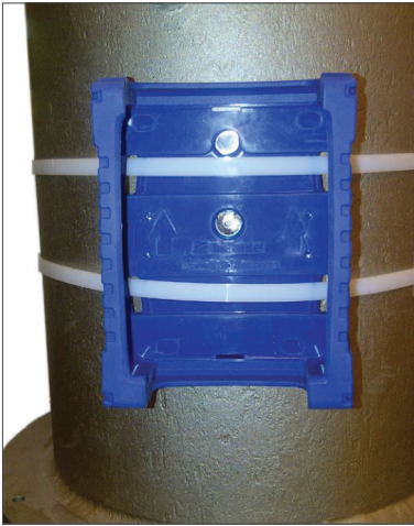
Protective Boot attached with tie wraps

When it is not possible or convenient to use screws to secure the Micromate unit in place, the protective boot can be held in place with large plastic tie wraps or metal straps. The slots in the bottom of the boot provide space for these straps while not interfering with the installation of the unit.