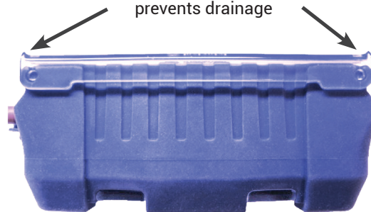
Durable silicon boot side view