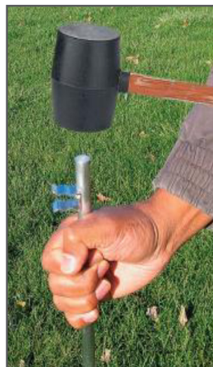
Figure 3. Hard Ground Installation