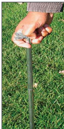
Figure 2. Soft Ground Installation