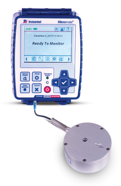
Micromate Seismic Monitor With Geophone