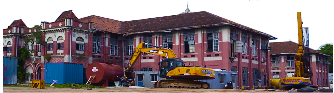
Piling Construction Around The Transworks House