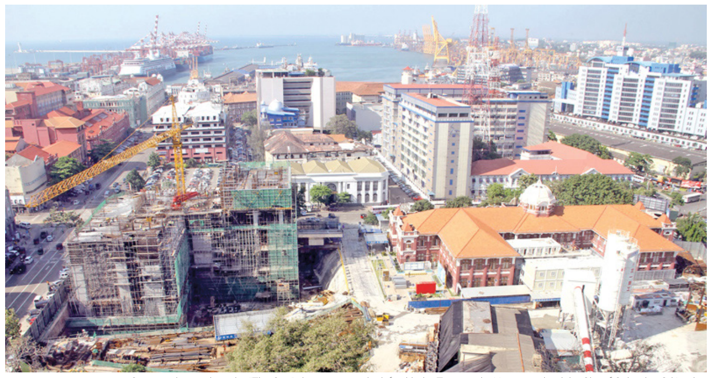
Construction work on the "The One" skyscraper on the left with the Transworks House on the right, City of Colombo, Sri Lanka.

This direct feedback was crucial in allowing the contractor to remain on schedule and make dynamic changes on the machinery's power, bore speed, and applied pressure to minimize vibration propagation and preserve the structural integrity of the historical Transworks House. By consistently monitoring the Transworks House during the pile driving, this phase of the project was successfully completed with no issues.