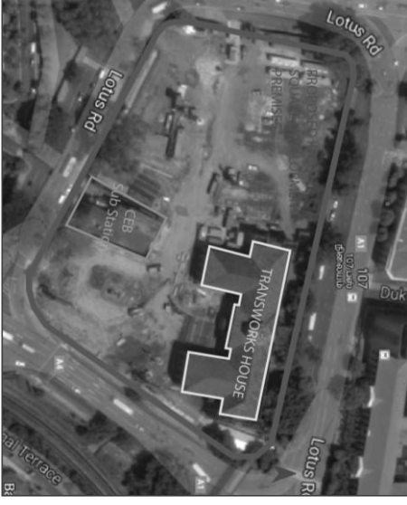
Left: An Urban Architect's Proposed Design Of "The One" Skyscraper Project. Right: The Outline Of The Transworks House To Be Preserved During Construction.