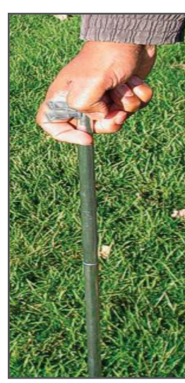
Figure 2. Soft Ground Installation