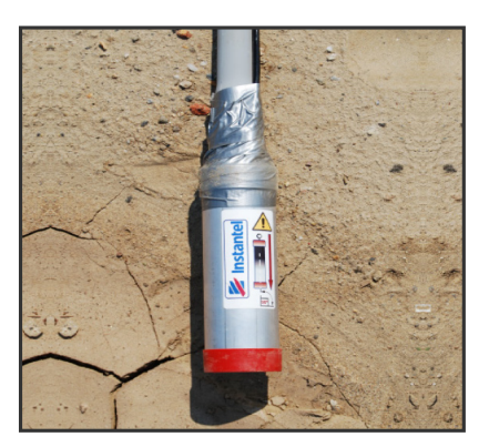
1. Prepare the borehole geophone by wrapping the connections with electrical tape to keep them clean.