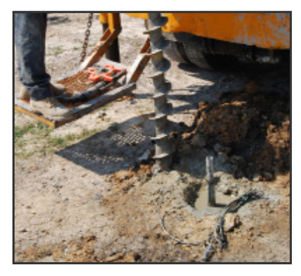
5. Hole filled with connectors ready.