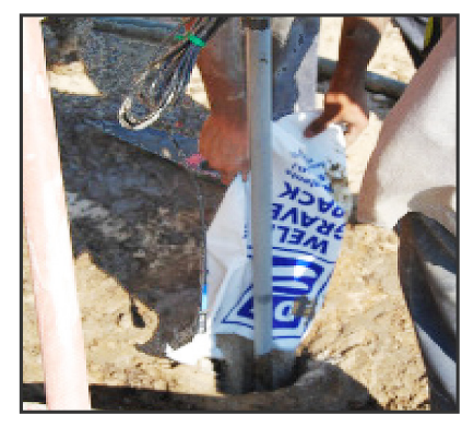
3. Fill around the borehole geophone and cable with gravel pack.